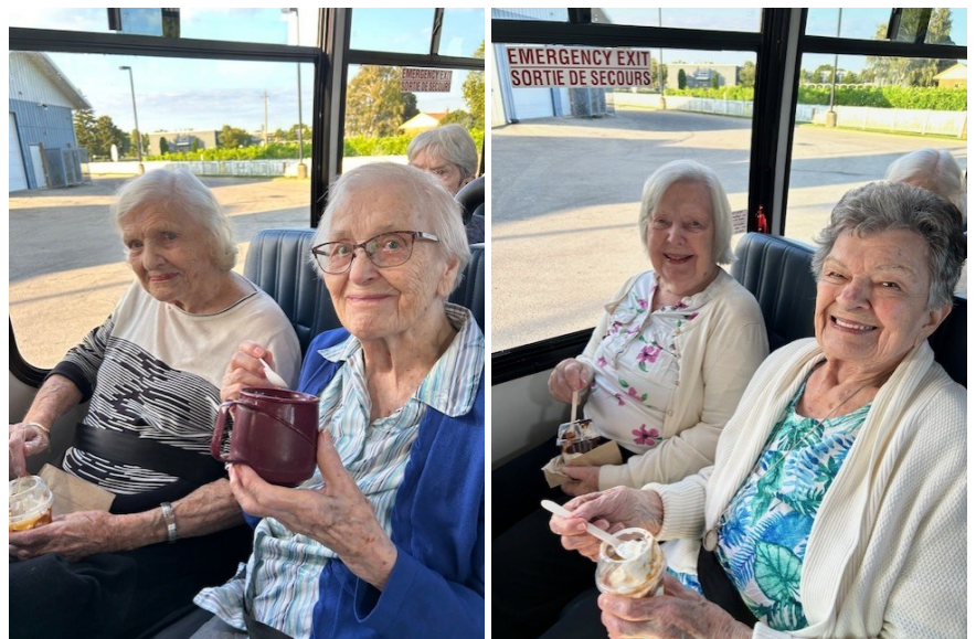
Sightseeing bus trip with a quick stop for an ice cream.

There is a FAMILY & RESIDENT INFORMATION BOARD on the first floor across from the bathrooms and Tuck Shop. Take a look for information posted about our Home!