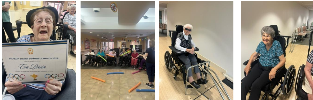
Olympic fun and bowling!