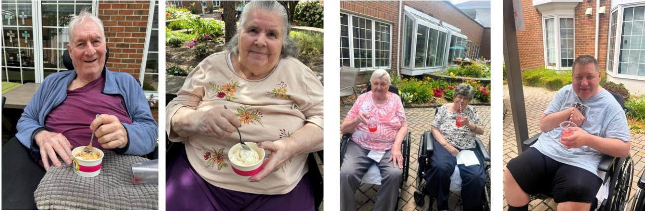
Our Marble Slab and Slurpee treats!