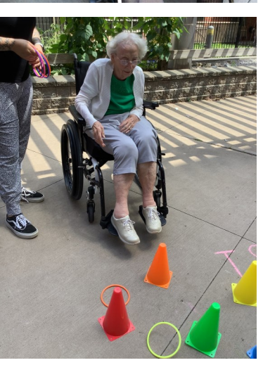
By all these lovely tokens September days are here, With summer's best of weather And autumn's best of cheer.—Helen Hunt