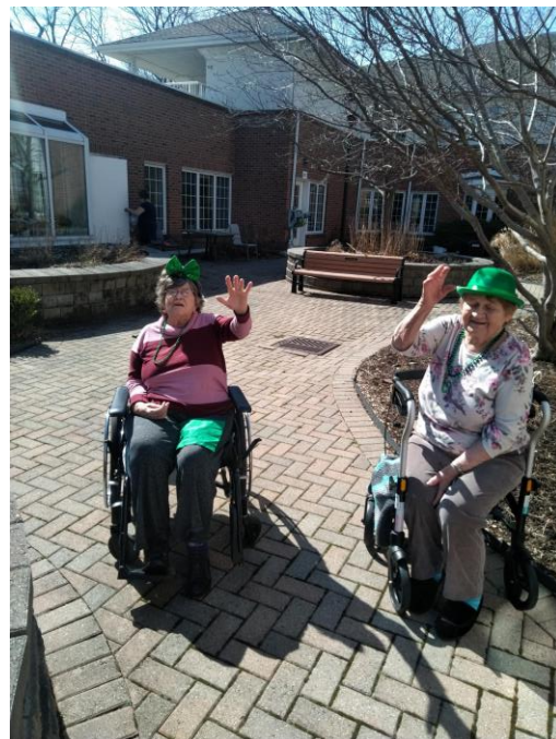
Getting outside on St. Patrick's Day!