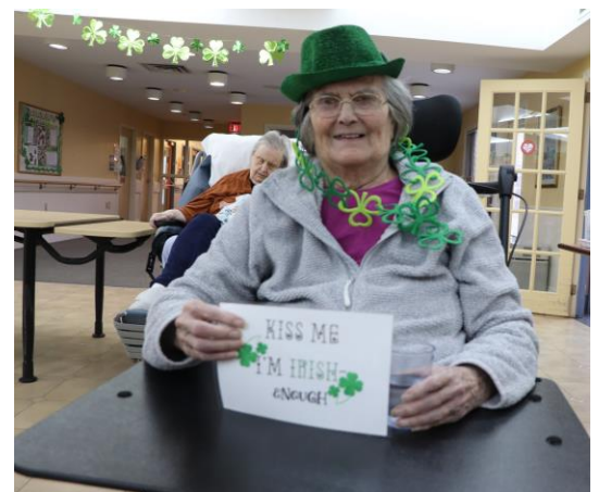
Happy St. Patrick's Day!