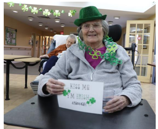
Happy St. Patricks Day!