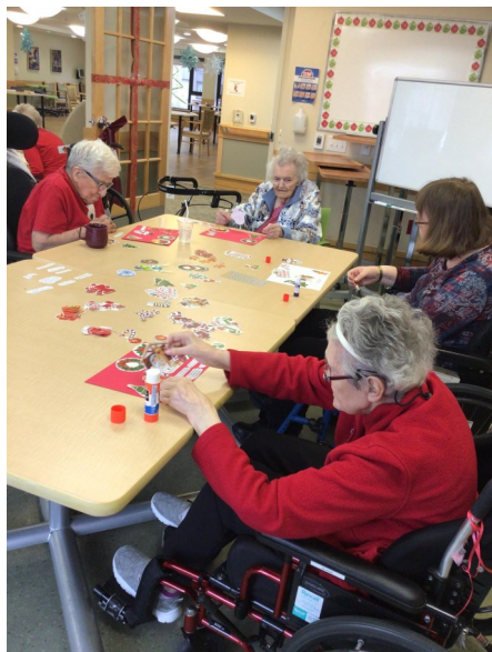
Some of the ladies working hard on Christmas cards