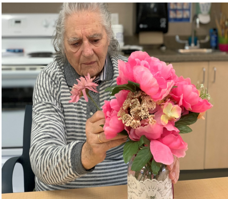
Creative hands at work

Summer is coming, the flowers and plants are being planted, the mulch will be topping off the gardens. At this time, the temperature outside always goes up and down. As maintenance we are always monitoring the temperatures. We keep the inside temperatures between 22°c and 27°c. If you feel uncomfortable in your room, please tell the nurse. The nurse will input the concern into the computer system. We will send someone up as soon as possible to rectify the issue. Don't forget if you have any maintenance issues bring them to the nurse and maintenance will get to them right away. Thank you.