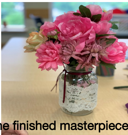
The finished masterpiece!!