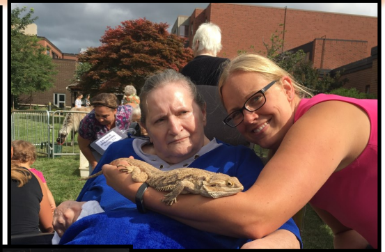
Exotic Petting Zoo!