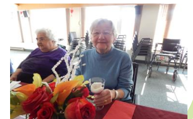
Celebrating Valentine's Day!!