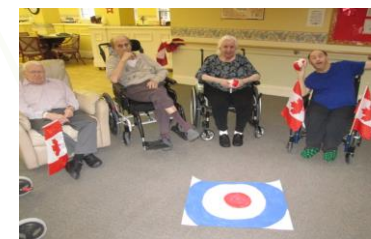
Winter Olympic Games